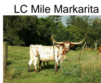
LC Mile Markarita