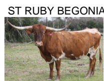
ST RUBY BEGONIA