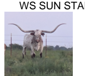
WS SUN STAR