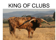
KING OF CLUBS