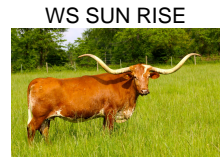
WS SUN RISE